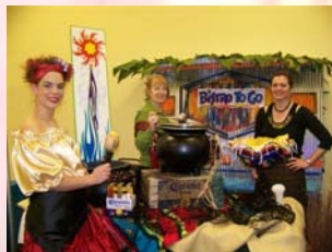
2007 Winning Display Bistro to Go