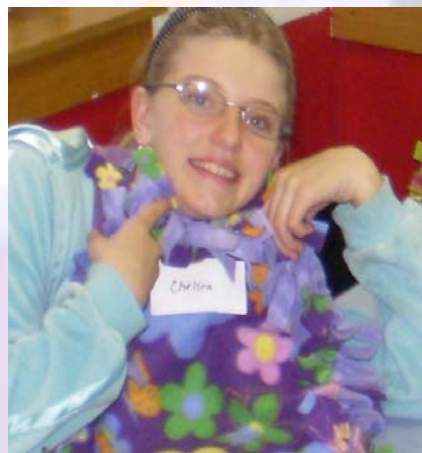
Blankets for adopted pets from Learning to Serve Class